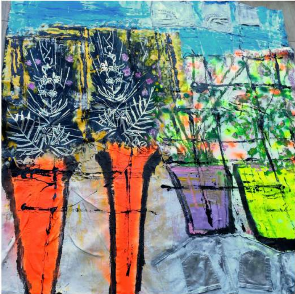
Flowers and Sequins | Mixed Media | Acrylic on recycled jeans Private Collection of AlSerkal Cultural Foundation Dubai UAE