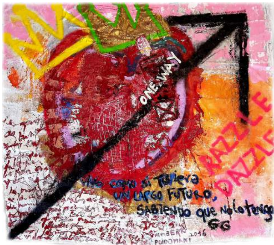
The Kingdom of Heart | Mixed Media | Acrylic, glue, gesso and sand on recycled jeans | 75 x 53 inches