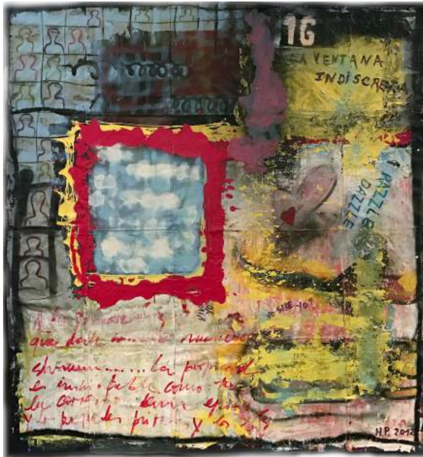
Could it be me | Mixed Media | Acrylic on recycled jeans | Private Collection