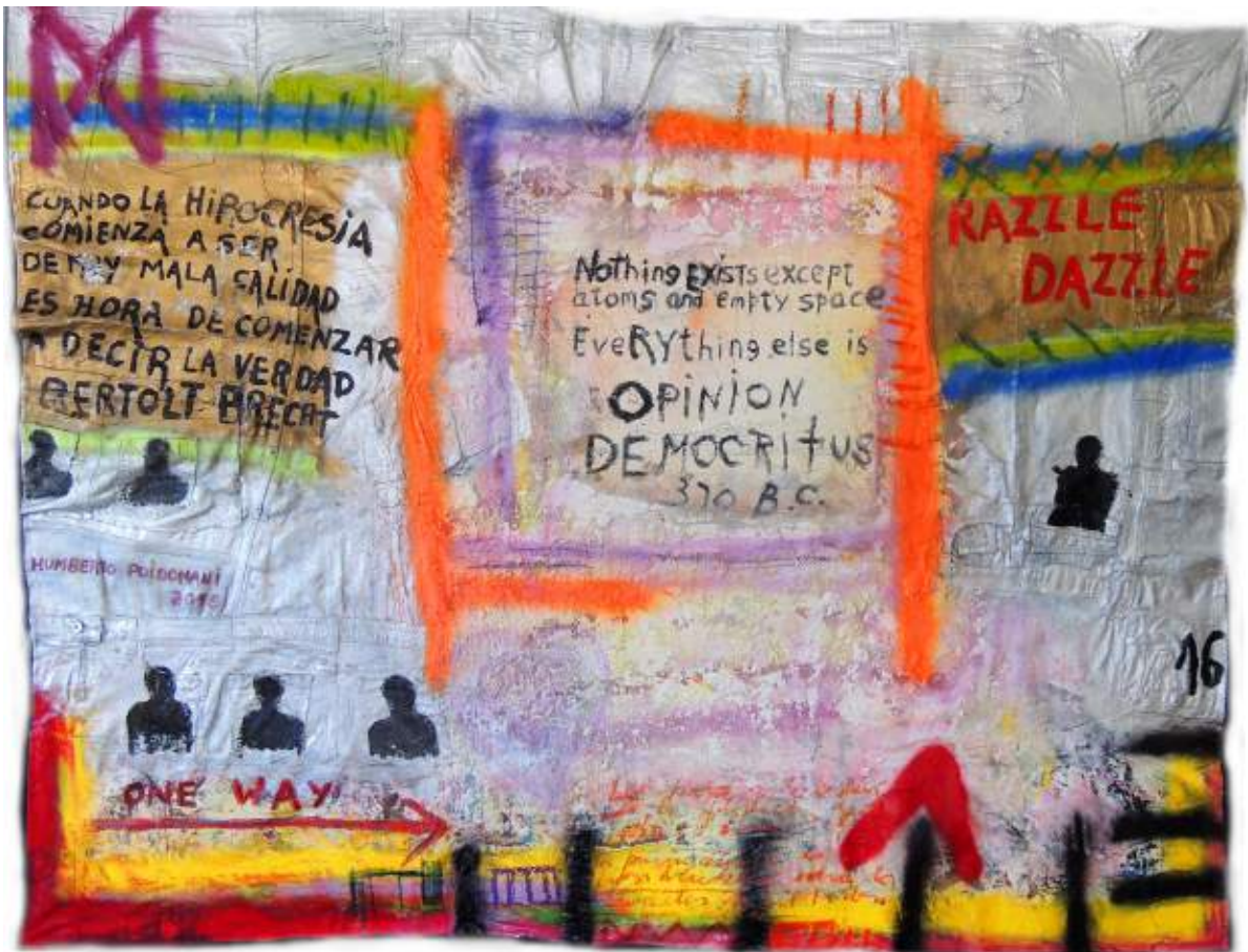
Adagio | Mixed Media | Acrylic on recycled jeans | 82 x 64 inches