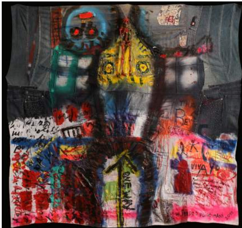
Untitled | Mixed Media | Acrylic on recycled jeans | Private Collection