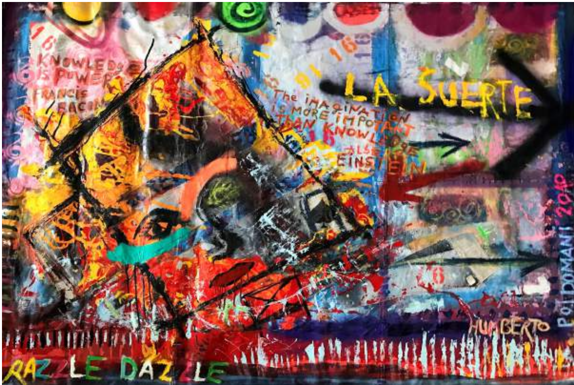
Lady Luck | Mixed Media | Acrylic on recycled jeans | 83 x 58 inches