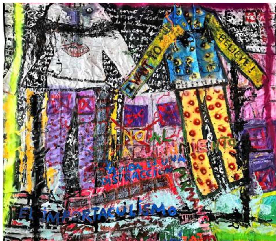
Flying Away | Mixed Media | Acrylic on recycled jeans | 72 x 68 inches