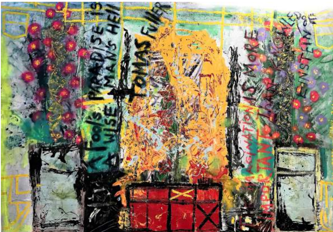
The Garden of Wisdom | Mixed Media | Acrylic on recycled jeans | 80 x 65 inches