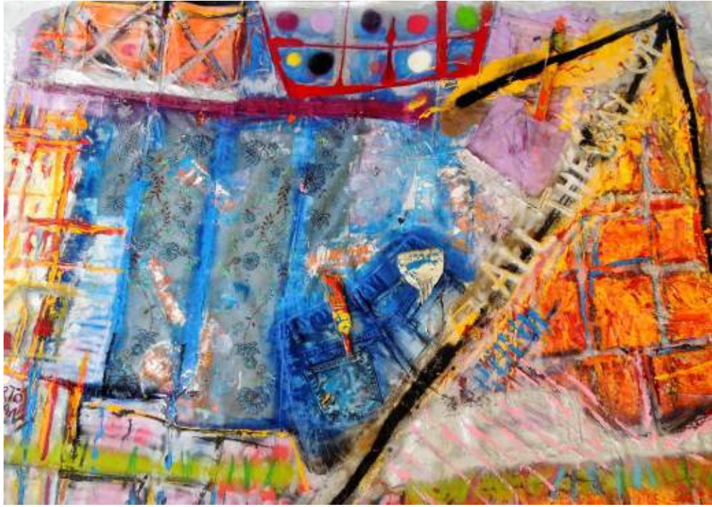
Azurro | Mixed Media | Acrylic on recycled jeans | 80 x 65 inches